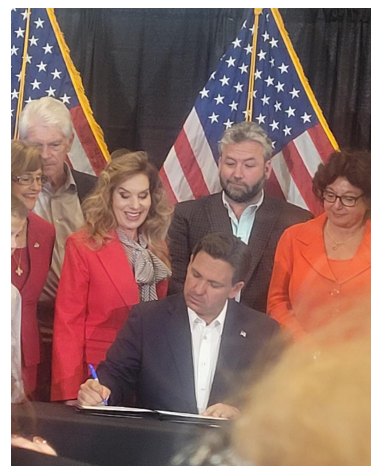
Florida State Gov. Ron DeSantis signing Senate Bill 1758.

This is a significant step toward a more inclusive, supportive environment. Thanks to Senate President Kathleen Passidomo and all involved! □