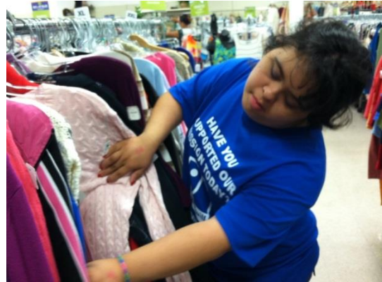
(Follows all rotation guidelines for all inventories on sales floor.)