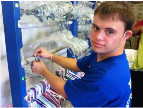
(Sort, box and label hangers by type.)